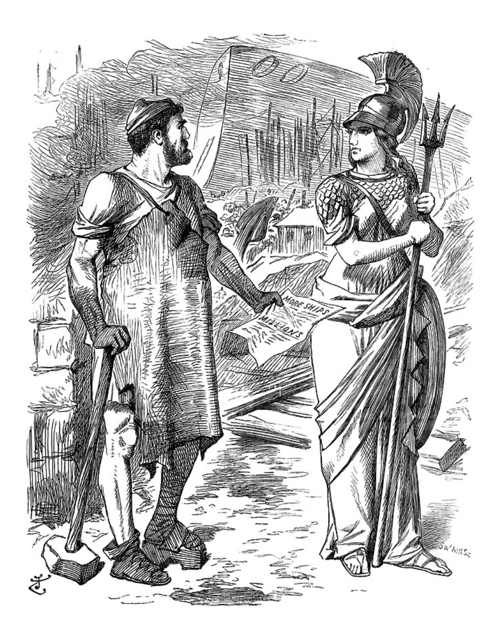
"MONEY NO OBJECT!"

Vulcan. "THIS'LL RUN INTO MONEY MA-AM!" BRITANNIA. "NEVER MIND ABOUT THAT AS LONG AS I CONTINUE TO RULE THE WAVES!!"