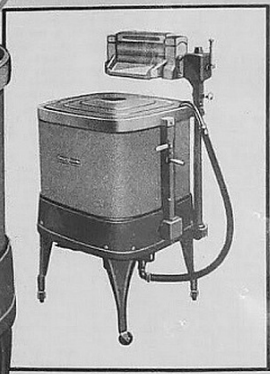
NEW GENERAL ELECTRIC SINGLE TUB WASHER—Model L. A companion to the new 2-tub spin-baker replaced by a new and advanced type wringer and the G-E ACTIVATOR, of course. Has water pump that transfers and drains all water, same square shape, identical quality and finish and washes with the same efficiency and satisfaction found in the 2-tub. Smaller than the 2-tub model, of course, and correspondingly lower in price.